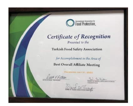
Best Overall Affiliate Meeting

Indian Association for Food Protection in North America