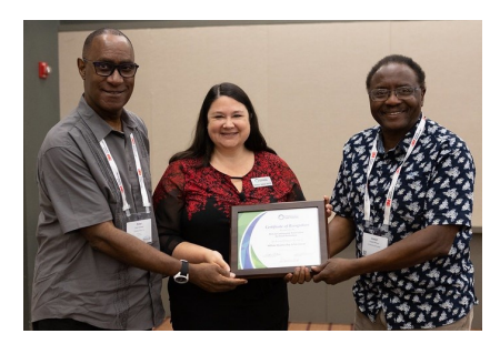
Affiliate Membership Achievement

African Continental Association for Food Protection