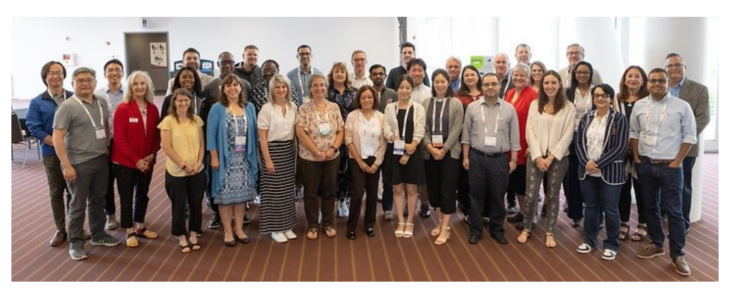
IAFP Affiliate Council Meeting, July 31, 2022